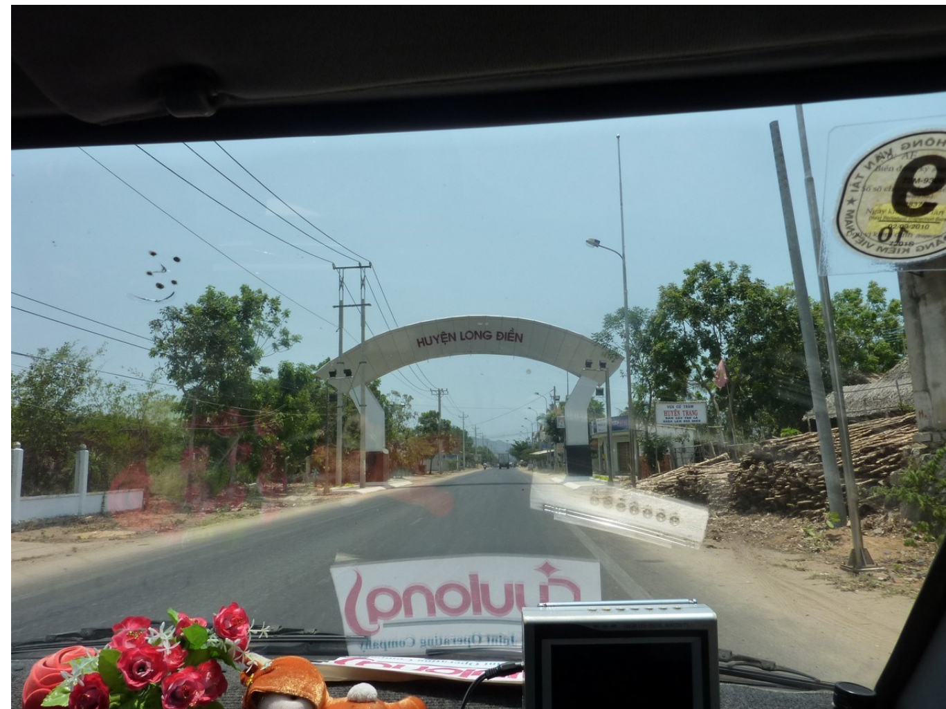
Below: Long Dien today.