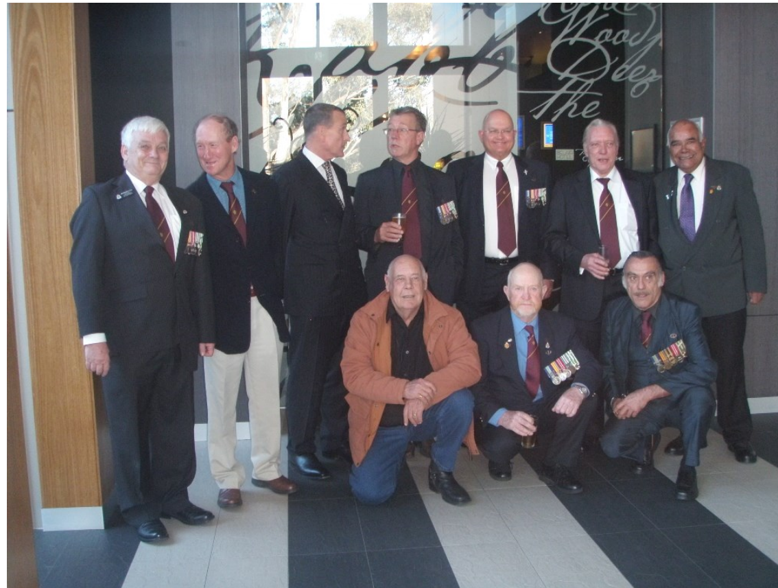
At t h e B e l a i r