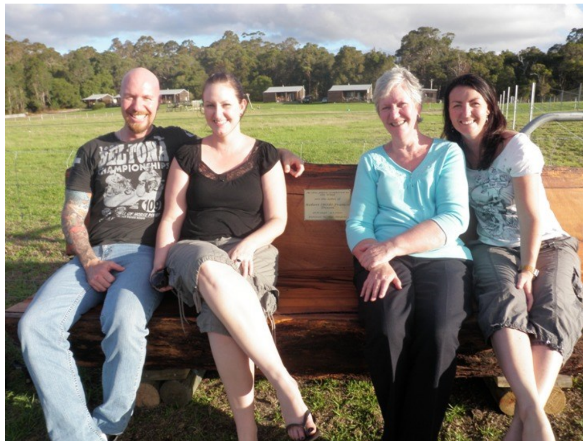
Bob's memorial bench seat.