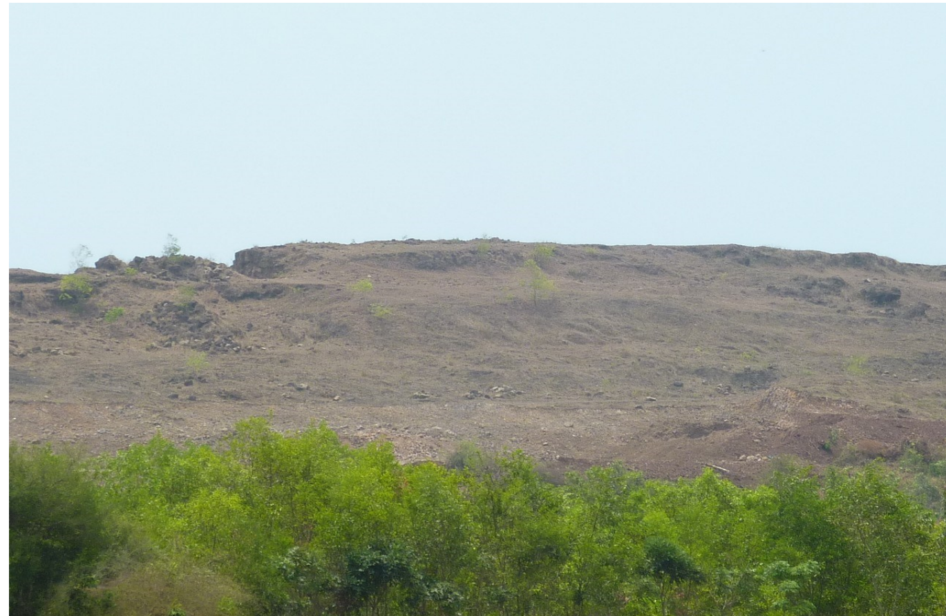
Above: the Horseshoe today: Below: The spoils of war on display in Hanoi today.